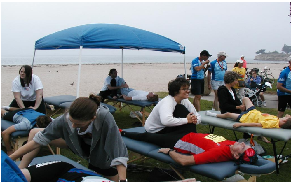
Community Outreach Opportunities